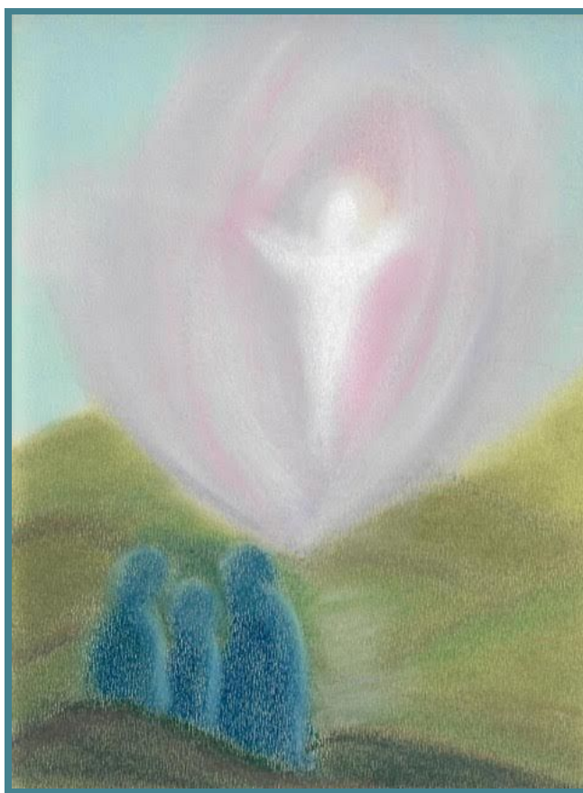
Pastel by Melissa Grable inspired by Ninetta Sombart's "Das Grab ist leer" (the grave is empty)