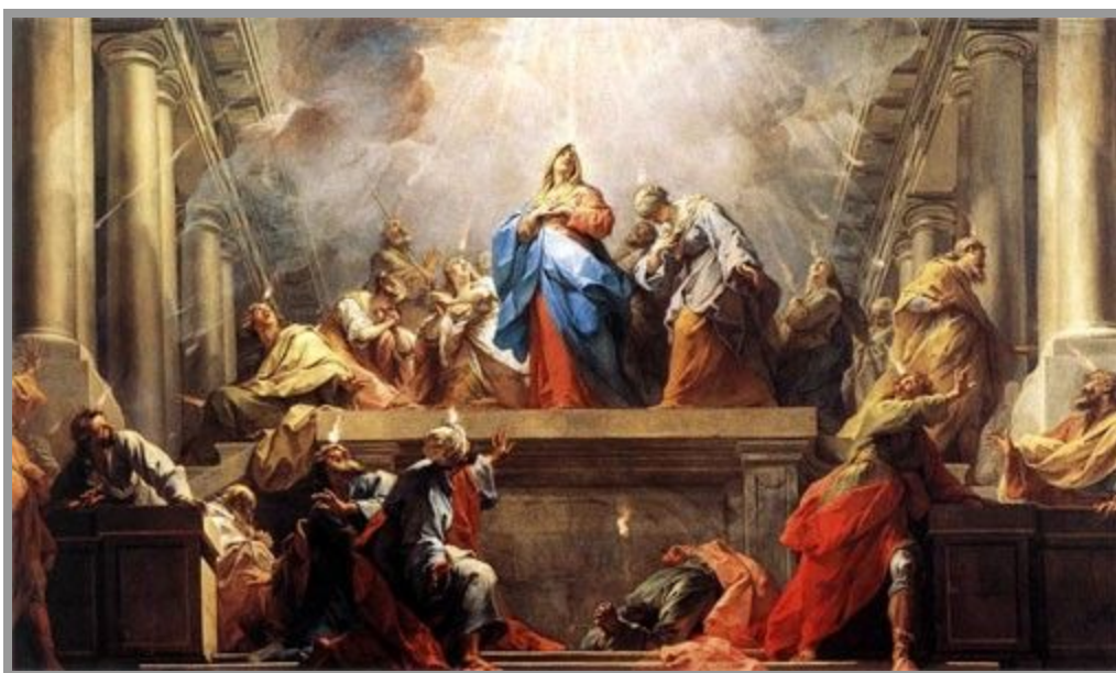
The depiction of the “Tongues” descending on the disciples, Jean II Restout 1732

A few words on the meaning of Pentecost: